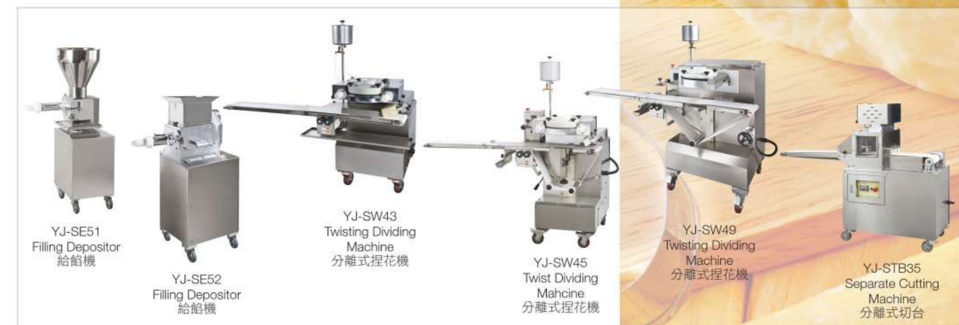
YJ-SE51 Filling Depositor 給餡機